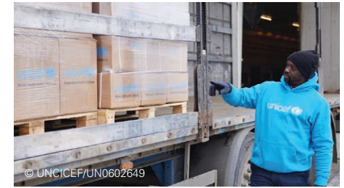
▲ A staff inspects supplies that have arrived in Lviv, western Ukraine.