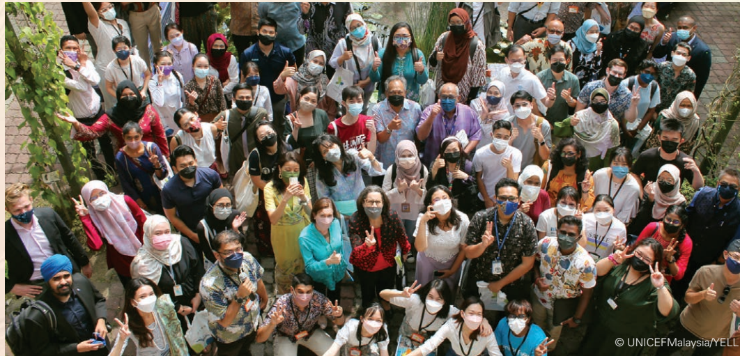
▲ A group photo taken with the YELL team, guests, and partners